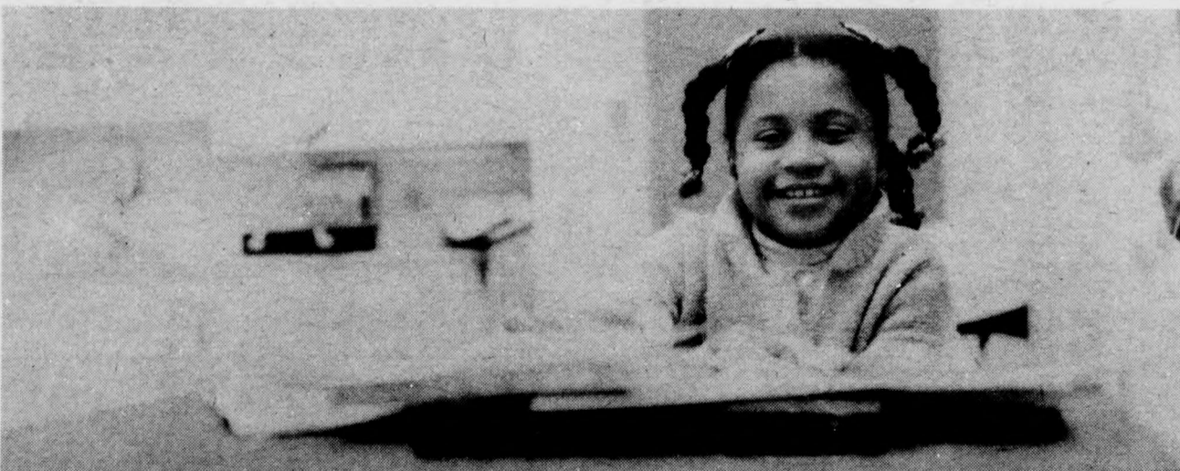
Education - intelligent child page 25