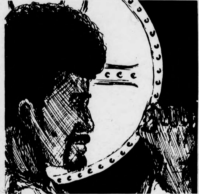
Relating - Black Jesus page 11