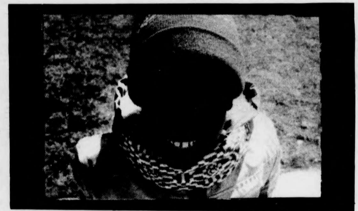
Final words page 27