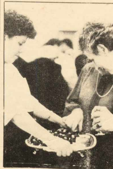
An exercise in self-indulgence

A polite letter, courtesy of our Resident Assistant, satisfied my now-rabid curiosity. "Hi Gals!" it began. (Oh, God no... the last person to use that odious term died a sudden death in the hands of local militant feminists.) "Nov. 8 is the President's Installation to be held here in Sherriff. There will be all sorts of "prominent community members" milling about so we are asked to move quickly through the lobby, not to carry in liquor from 5 p.m. on and not to keep our male guests waiting. The study hall and library will be in use as will the cafeteria... so we'll be eating in the Gardens in the SUB-Graffiti nite, excellent food and lots of fun!"