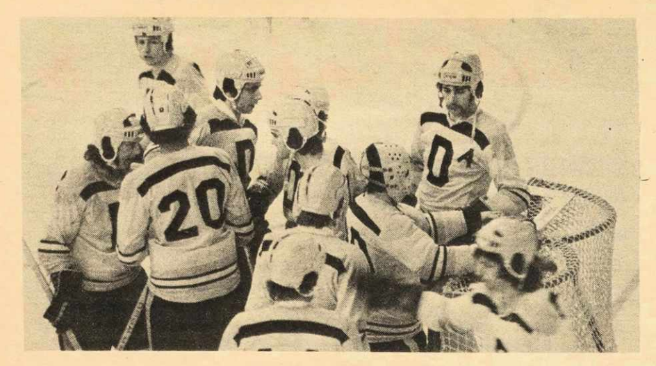
A happy group of Tigers.

Please Note: Dal vs, Memorial at the Dal Rink Şaturday 8:00 and Sunday at 2:00.