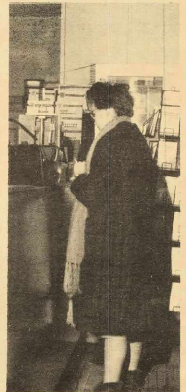
"You mean I can't get my textbook till March 30?" —Munroe