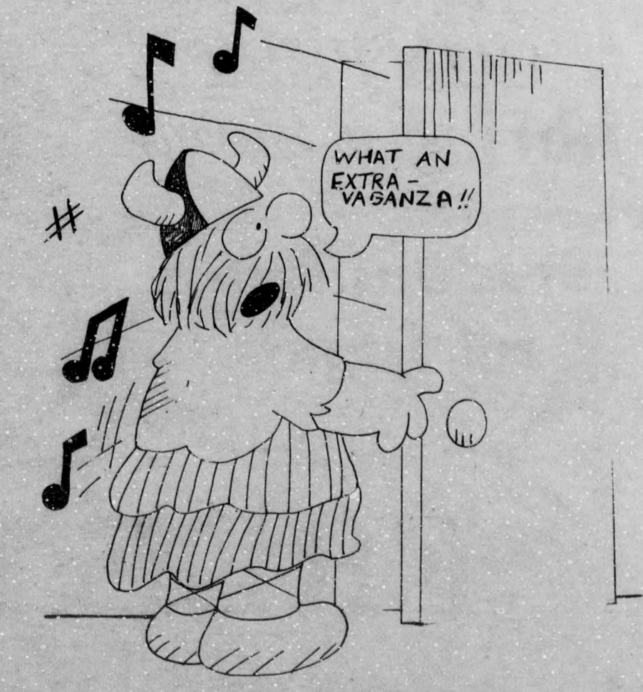
Extravaganza! Saturday, January 15

Blue Hunt 300 Toboganning at Buchanan Field Opening Ceremonies followed by a torch parade. Speedy Gonzales Pub featuring Tequilo (SUE cafeteria).