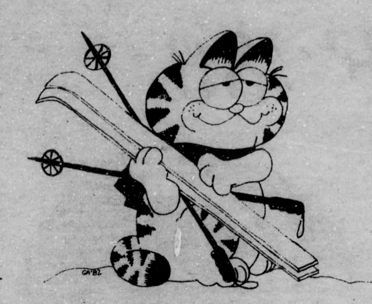
Ski and Steak Day. Friday, January 14