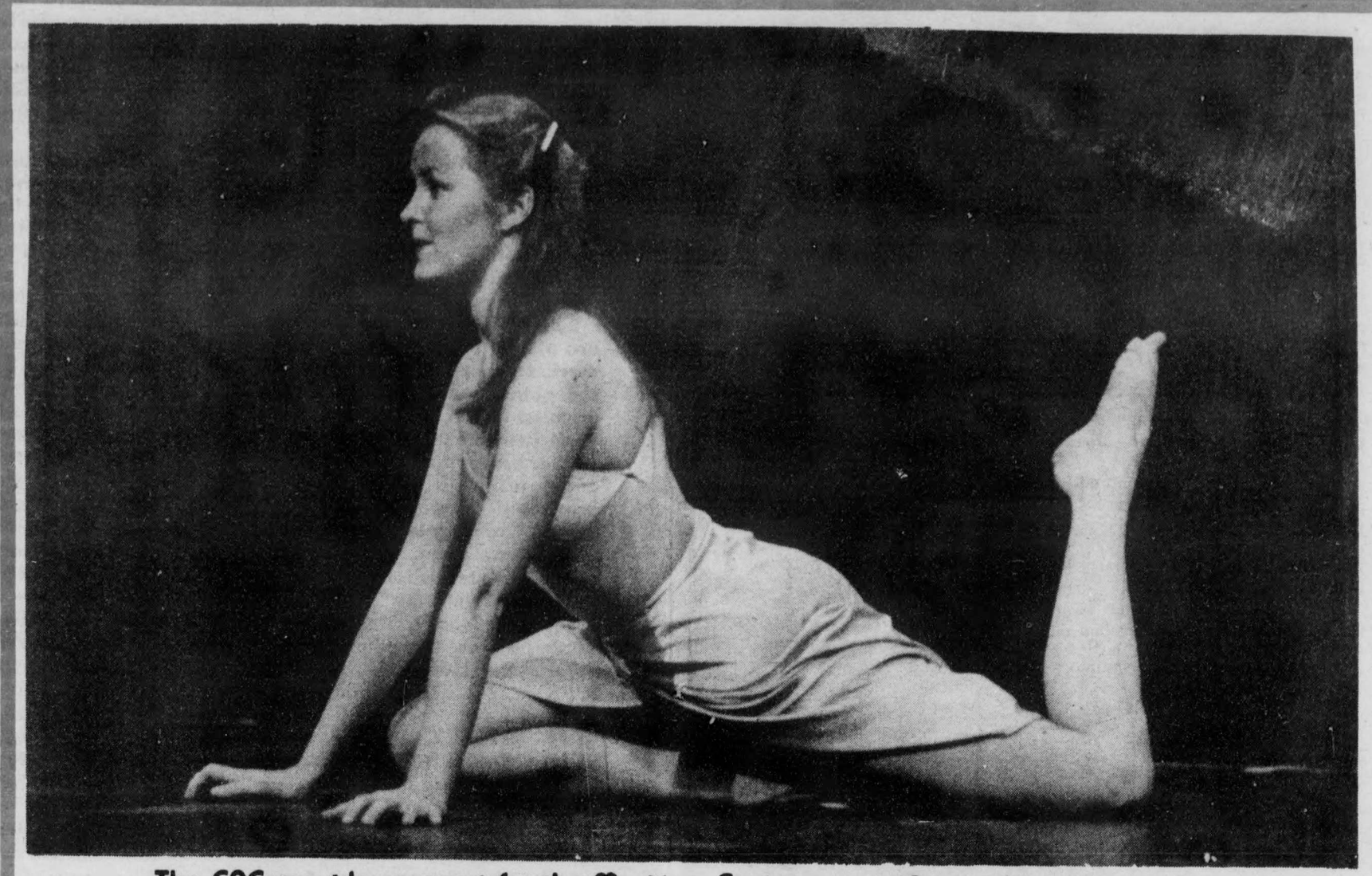
The CAC provides support for the Markime Contemporary Dance Company