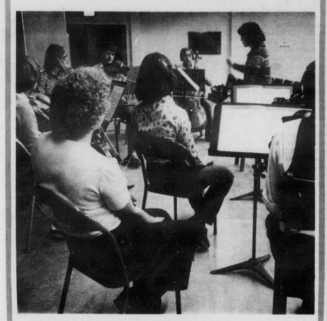
The Fredericton Chamber Orchestra recently received a grant from the CAC