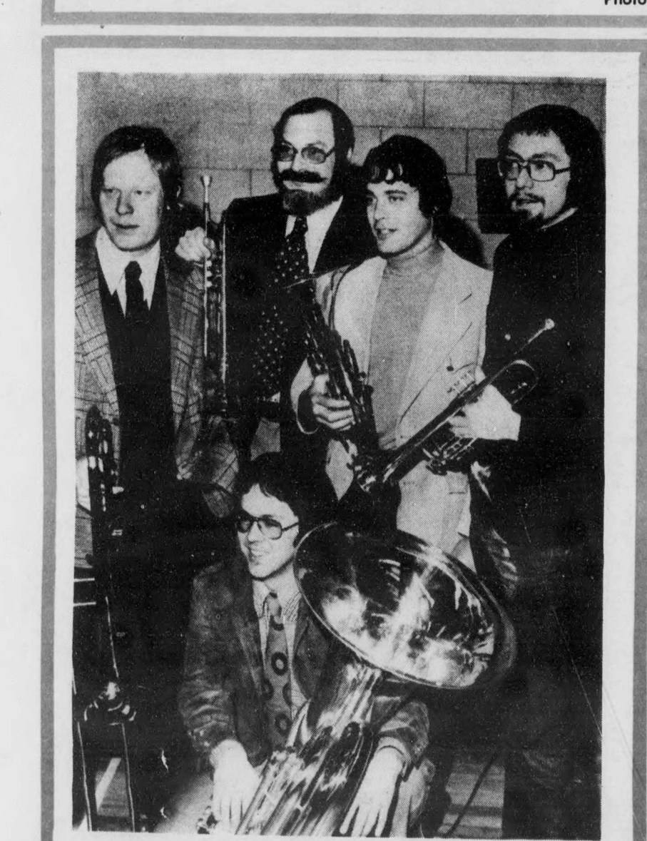
The Canadian Brass has been a popular event in the concert series