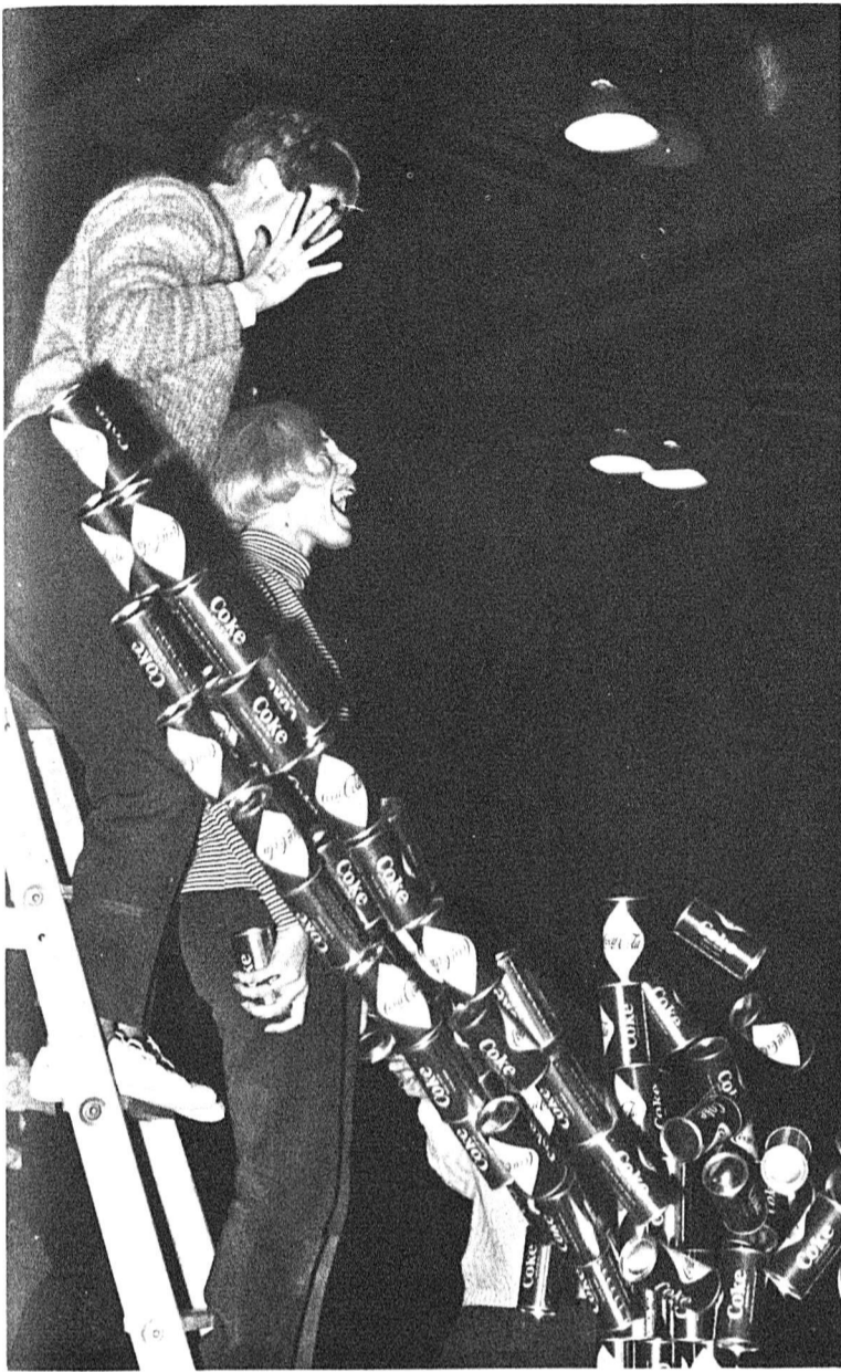
PLOP —With a mighty roar and rattle, the huge pile of cans came tumbling to the ground. The inevitable mishap occurred in Friday's Theta Chi Cantest contest, in the multi-purpose room of SUB. It was a crashing success.