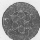
Locked Coil Aerial Cable or Colliery Guide.