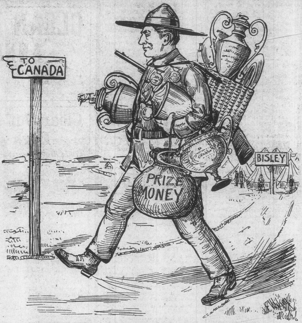
WHEN JOHNNY COMES MARCHING HOME FROM BISLEY.

committee will impress upon Hon. Mr. Pugsley the necessity for the enlargement of the dry dock accommodation at Esquimalt in order to meet