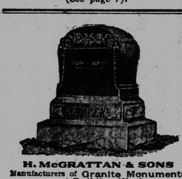
Manufacturers of Granite Monuments and Building Work. 55 Sydney St., St. John, N. B. 'Phone 2290