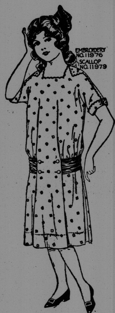
A lovely little frock in pink satined chambray with embroidery trimming about the neck and sleeves and a belt of black mesaline.

Among the fashionable materials for children's dresses are satin-figured chambrays. The model shown here is developed in two shades of pink. It is made without a lining, having body