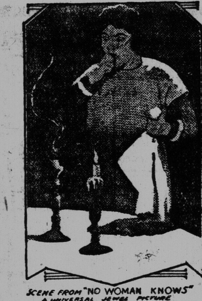
Scene from "NO WOMAN KNOWS" A UNIVERSAL JEWEL PICTURE