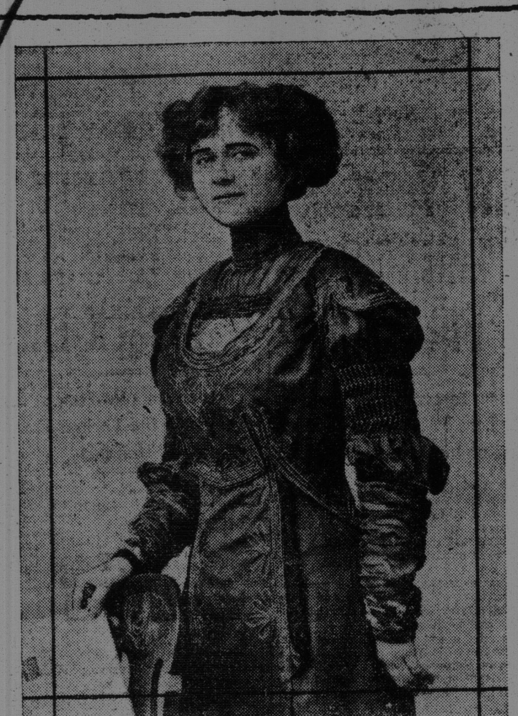
A "MAGPIE" GOWN FOR AFTERNOON WEAR.

Berlin, Germany.—Only millionaires can afford to patronize the "Gilded Palace," recently fitted up in the old Kaserhof. The furnishings are the most elaborate ever attempted in a public resort. The waiters wear knee breeches, red vests, blue velvet coats and white gloves. Dishes, costing $2.50 each, are served on solid plate. It takes more than powdered flaccidities and costly plate to make a reliable meal. Health and sound digestion are the best sauces. "Fruit-atives" is the wonderful little fruit liver tablets, correct indigestion, sour stomach and "heart burn," and positively cure dyspepsia, because "Fruit-atives" tone up and sweeten the stomach and regulate the bowels. No other remedy sold in Canada has benefited so many people in the same length of time as "Fruit-atives." See a box, 6 for $2.50, or trial box, 25c. "At" dealers, or sent postpaid on receipt of price by Fruit-atives Limited, Ottawa, Ont.