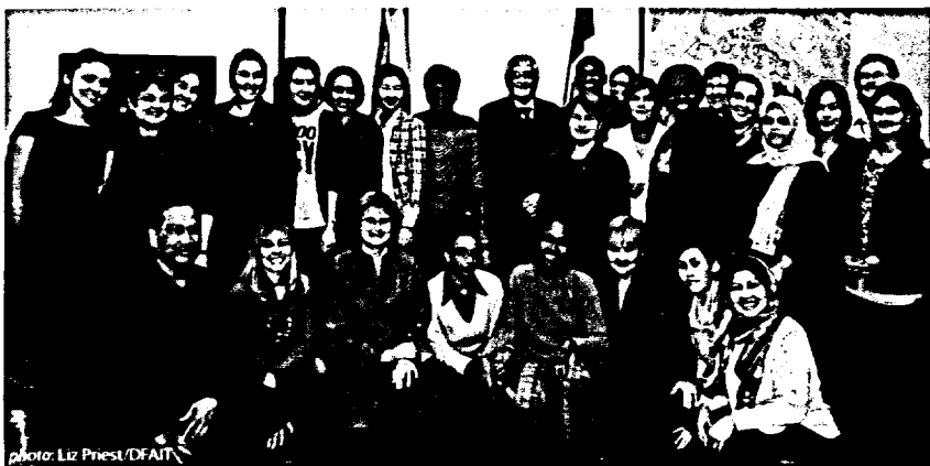
A group of 25 LES travelled to Ottawa in February to attend the In-Canada Program.