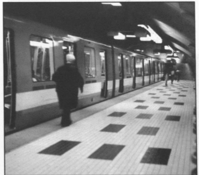
And underground in Montreal's Métro