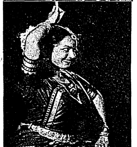
Folklorama hosts a wide variety of Asian performers each year