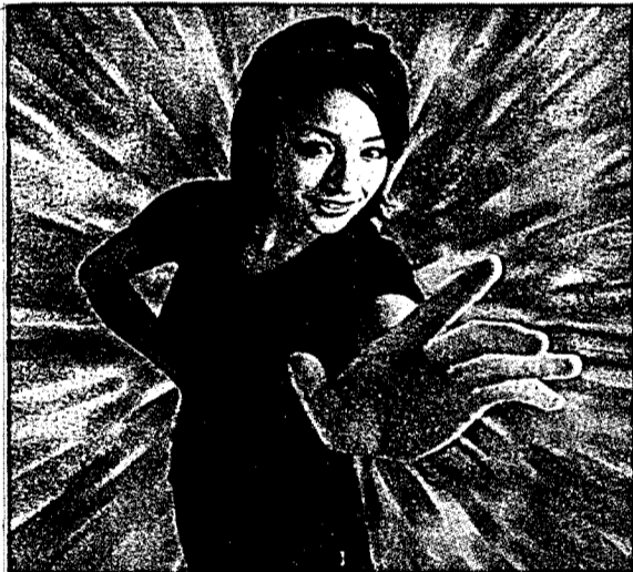
Official poster of Asia Connects Youth Conference

Delegates had packed their bags and were ready to go, but the Red River flood forced organizers to postpone Asia Connects from its original date in May to September 28 – October 5. Canadian and Asian youth are set to meet in late September to discuss their shared