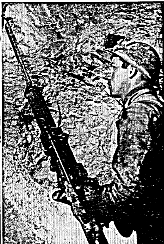
Drilling in an asbestos mine in Quebec.