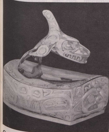
Gold bowl with killer whale on the lid by Bill Reid, 1971.

The Legacy is one of the most comprehensive exhibitions of northwest coast Indian art in British Columbia to focus on northwest coast contemporary art and the traditional background which shaped this art. Traditional and contem-