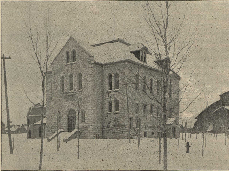
CARRUTHERS SCIENCE HALL.