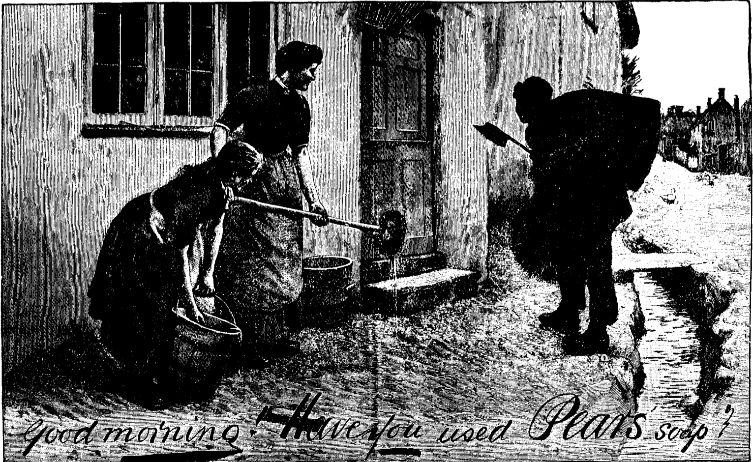
Good morning! Have you used PEAR'S soap? PARIS EXPOSITION.—PEAR'S' obtained the only Gold Medal awarded solely for Toilet Soap in competition with all the world. Highest possible distinction.