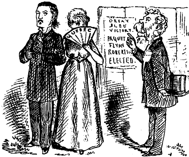
"GONE WITH A HANDSOMER MAN"

M. JOLY, TO THE FICKLE MISS QUEBEC.—Ah, very well, mademoiselle; it is true he is a prettier than I, but you may learn before long that "handsome is as handsome does!"