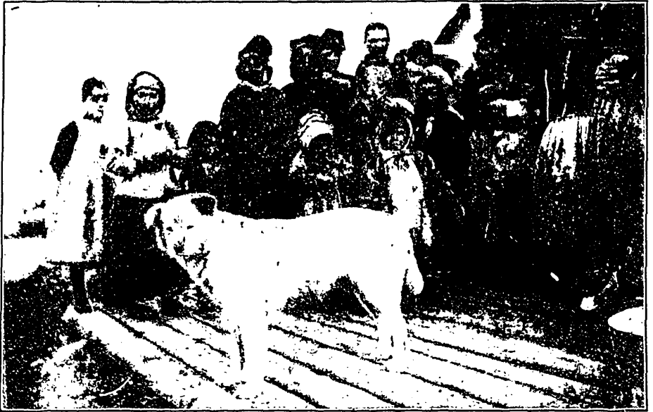
LIVEYERS, ESKIMO AND "HUSKIE."