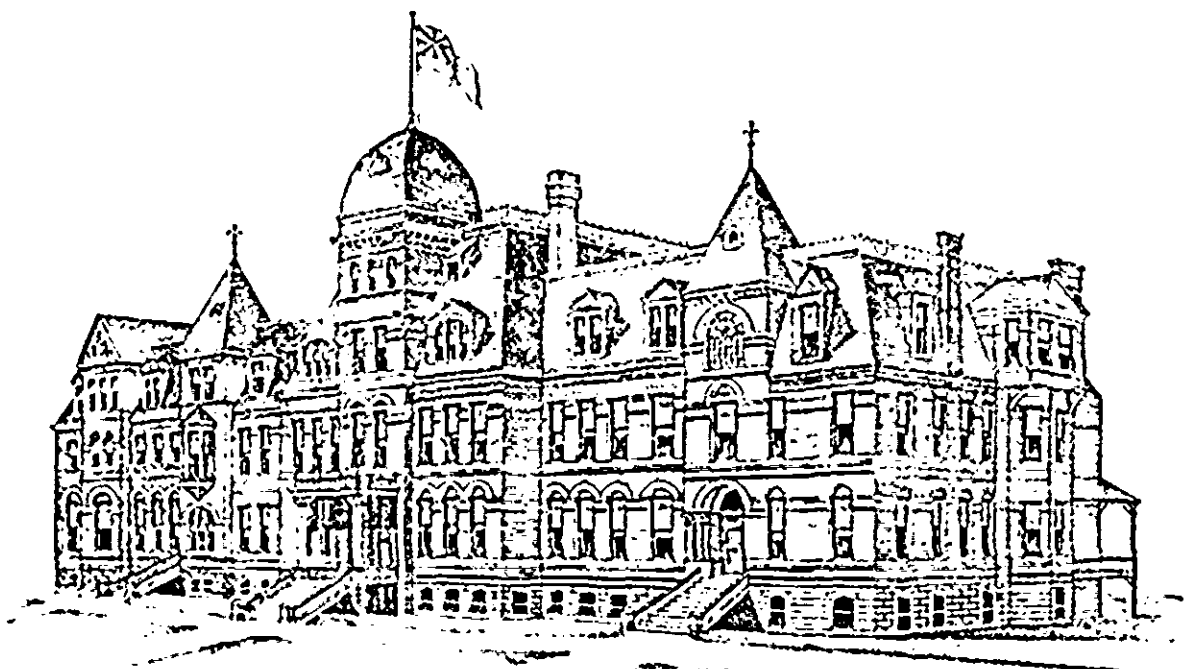
NEW INSTITUTION FOR THE DEAF AND DUMB AT HALIFAX, NOVA SCOTIA.

LETTERS AND PAPERS RECEIVED AND distributed without delay to the parties to whom they are addressed. Mail matter to go away if put in box in office door will be sent to city post office at noon and 2.15 p. m. of each day (Sundays excepted). The messenger is not allowed to post letters or parcels, or receive mail matter at post office for delivery for any one, unless the same is in the locked bag.