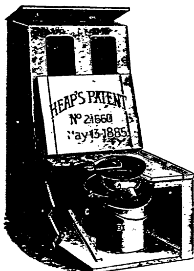
Inodorous Portable Bedroom Commode

- A Special Silver Medal Awarded at Toronto, 1885 -