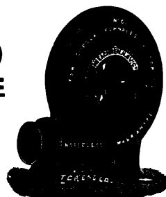
Steel Pressure Blower for blowing Cupola and Forge Fires

SANDERSON'S Tool and Drill CAMBRIA Cold Rolled and Machinery All Kinds of SHEET and PLATE