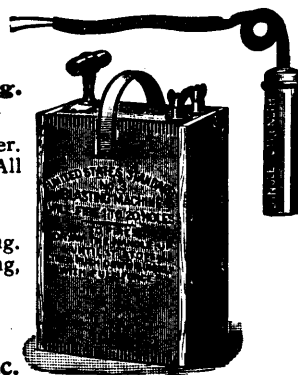
SEND FOR CATALOGUE

JAMES MACBETH & CO., 128 Maiden Lane, New York, U.S.A.