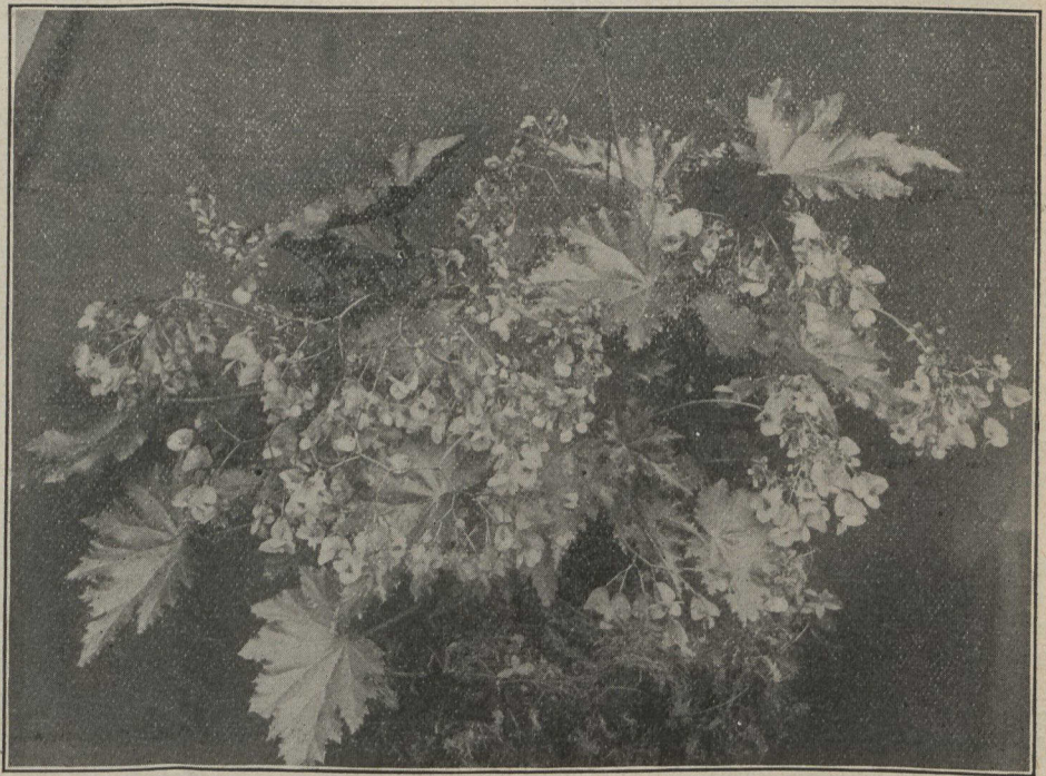
Begonia, Paul Bruant

"These wild specimens do exceedingly well in the open garden if they are given plenty of moisture and leaf-