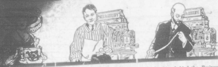
Woman behind the Pocketbook—the Clerk behind the Counter—and the Man behind the Business