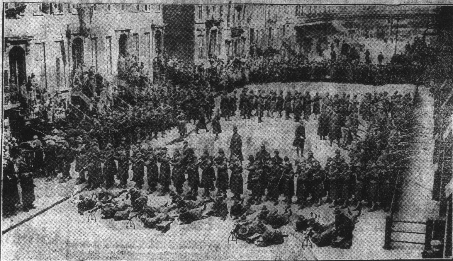
In the photo the Second Battalion of the Ninth Coast Defence Command New York Guard is demonstrating the formation which has proven to be effective in handling street rioters. The hollow square formation with machine gunners deployed in front of the square controls the street while troopers with levelled rifles back them up. The soldiers on the sides are covering windows on both sides of the streets.