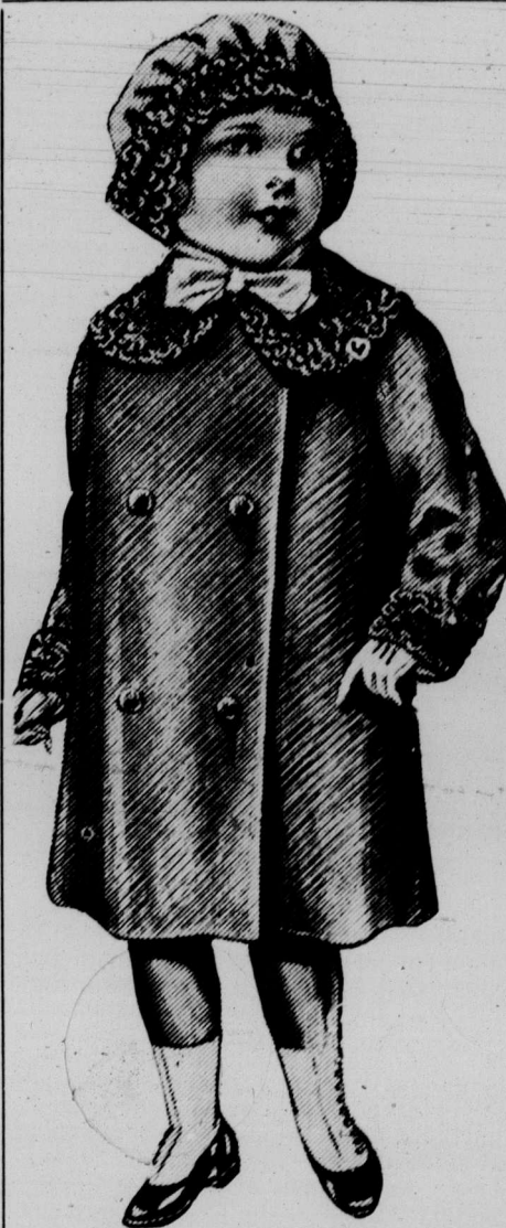
Child's Diagonal Cheviot Serge Set of Coat and Bonnet. Double breasted coat, round lay-down collar of black Persian lamb cloth with cuffs to match, flannelette lined. Bonnet to match. Colors: Scarlet, Navy, Tan or Copenhagen Blue. Lengths, 20, 22, 24, 26 in. Ages, 2, 3, 4, and 5 years. Order No. 185531—Price Prepaid 2.25

THE EATON CATALOGUE GIVES YOU THE WIDEST SELECTION in the choice of