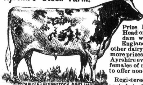
CARLYLE LESSNESSOCK, 2861 IMP. IMPORTED STOCK FOR SALE.