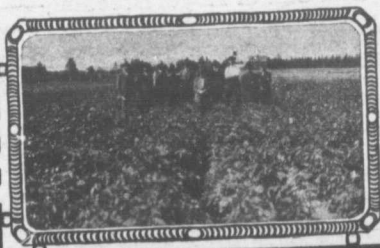
Illustration below shows Field Meeting of Seed Potato Growers in Algoma, Called by Agricultural Representatives to Discuss Disease Control and the Production of High Class Seed.

It cannot be expected that seed bought indiscriminately will give the best results. The factors governing the production of first-class seed potatoes hold true in New Ontario as they do in Old Ontario. The foundation stock must be as true to variety and as free from disease as is practicable. Cultural methods must be good, the crop must be inspected and rogued for disease in the growing condition, and the high standard thus obtained must be maintained by careful selection. Where none of these factors are considered it is idle to expect that seed from any source can be purchased with any assurance that the yields will warrant the expenditure involved. As neither Leaf Roll or Mosaic are indicated