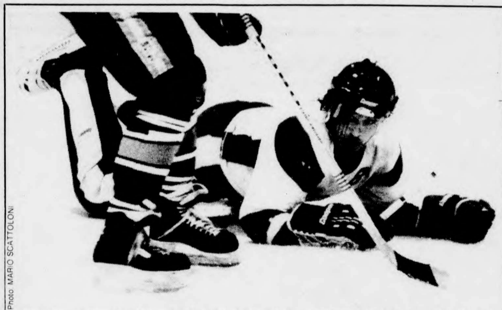
The Yeomen suffered a pair of weekend losses but remain in the playoff picture.

York used the same game plan of shooting from outside the key that worked against McGill. However, this strategy soon became a result of their inability to cope with Bishop's aggressive man-to-man defence, which prevented the York offense from driving inside to the basket.