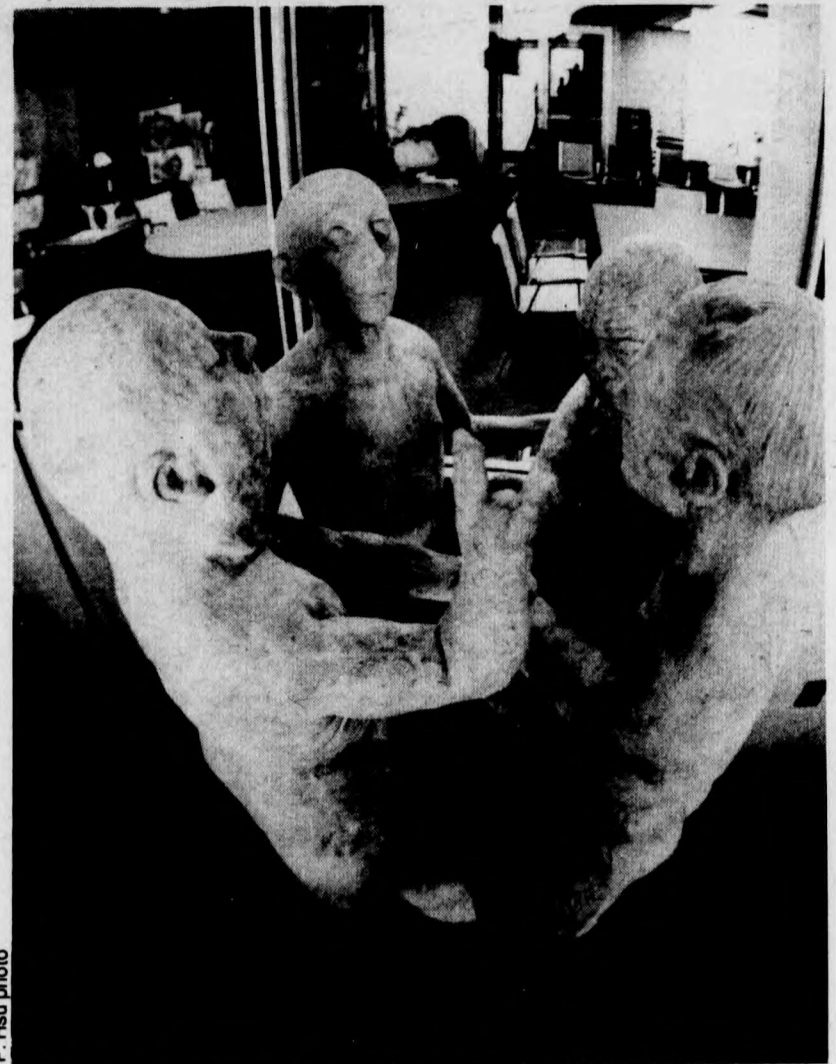
A rare photo of members of York's board of Governors gathering together for a chat in the Ross building.