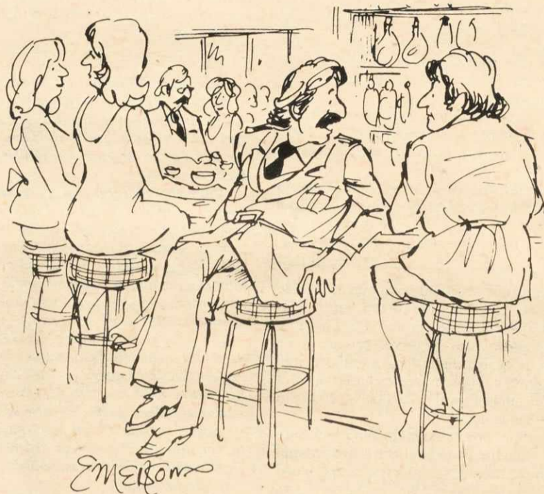
"I think she's interested in me. She asked if I've had a vasectomy."

With relief she had felt him move his arms. And then with horror felt his hands pin her arms down beneath him.