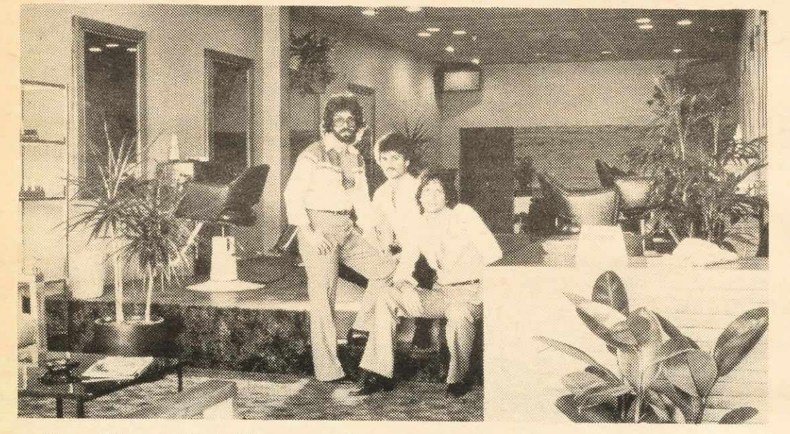
New Clayton Park Shopping Centre (At Dunbrack and Lacewood)