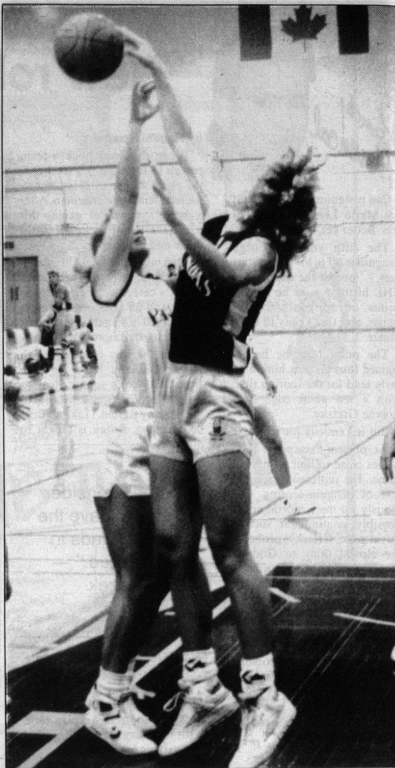
To make the playoffs, the Pandas must reach higher than last season.