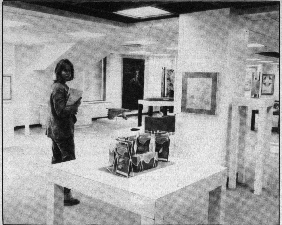
The BFA Art and Design Show: diversity is the common element

The show runs until April 12th. Hours are 11:30 to 4:30, Monday through Saturday.