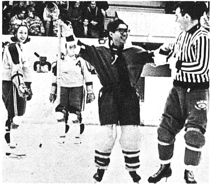
ACTION FROM LAST YEAR ... students, prof hockey game