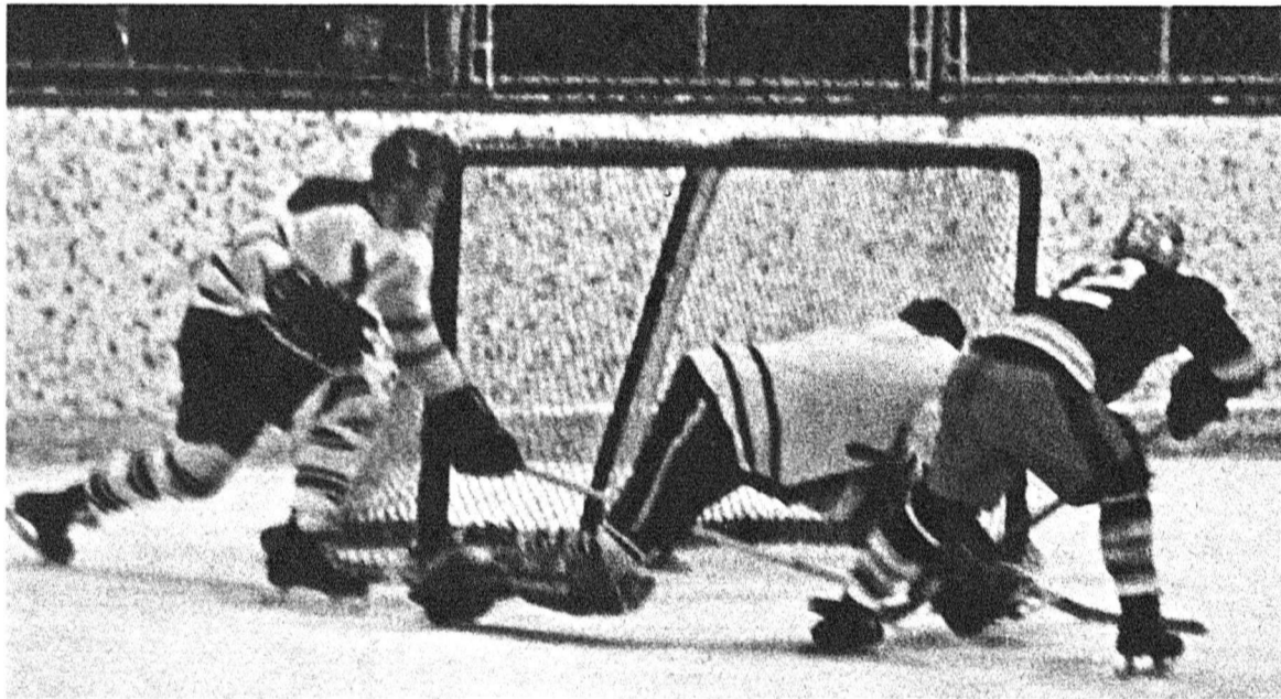
ANOTHER CEBRYK GOAL AGAINST THE X-MEN

... Bear star continues torrid scoring pace