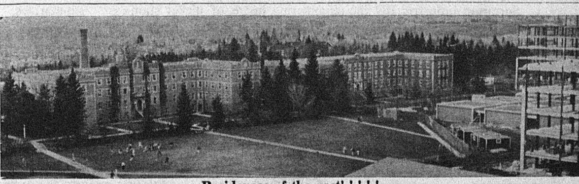
Residences of the past!!!!!