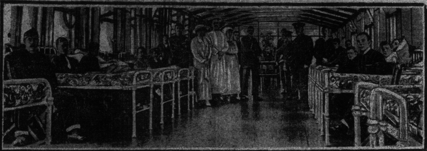
A ward in the Duchess of Connaught's Hospital at Chiveden in which there are at least 100 New Brunswick beds.