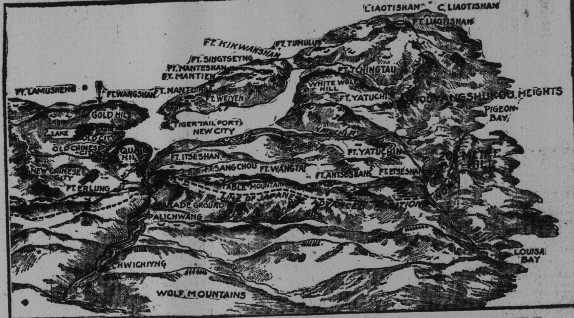
A LATE MAP OF PORT ARTHUR SHOWING THE KEY POSITIONS RECENTLY TAKEN BY THE JAPANESE