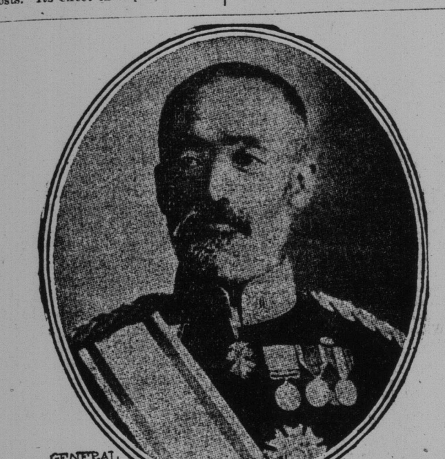
The Japanese Commander, the Man of Blood and Iron, Whose Assaults Upon Port Arthur Astonished the World.

rate end the horrible slaughter in one part of the theatre of war, and I sincerenation of Russia to continue the war sia's res Some Paris journals assert that Japanes at all costs. Its effect in Japan, however,