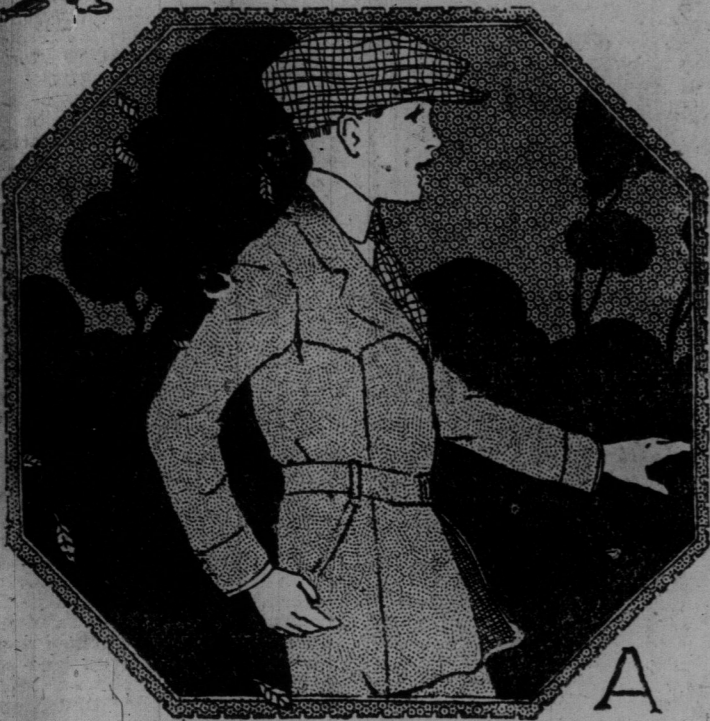
A. Illustrates a Boy's Suit of wool and cotton mixed grey checked tweed, in the single-breasted model, with all-around belt, with buckle fastener, yoked front and back, with raised seam running down centre; slash pockets and full-fashioned bloomers with governor fastener at knee. Sizes 29 to 35. Price, $16.50.

Store Closes Saturdays at 1 p.m., Other Days 5 p.m. "Shorter Hours" "Better Service"