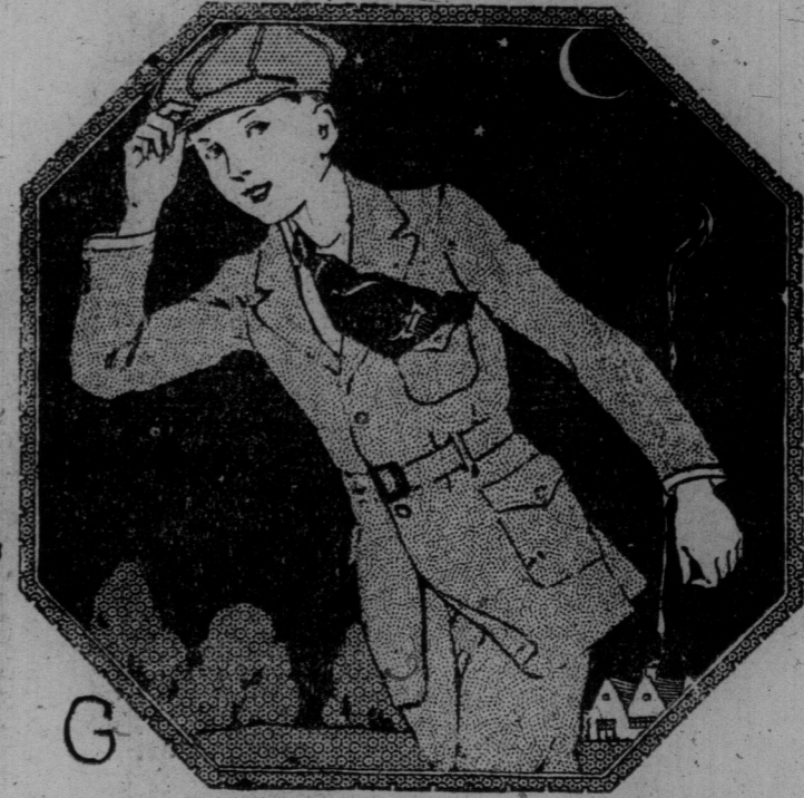
G. Illustrates a Boys' All-wool Worsted Suit, in a dark brown mixture, with a lighter brown stripe running through, and in the trencher single-breasted style, with all-around belt, having combination buckle and button fastener; form-fitting back; full-fitting bloomers, with belt loops, side watch, hip pockets and governor fastener at knee. Sizes 29 to 34. Price, $25.00.