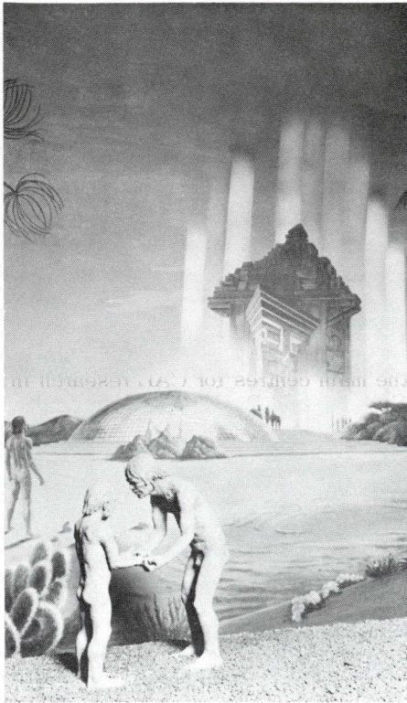
A scene from "The Immense Journey"

a remarkable list of the uses the Plains Indians made of this animal. Tails were fashioned into fly-swatters; inner skins were used as winding-sheets for the dead; dung was burned for fuel; the stomach became a water-bag; ribs were crafted into sled runners; and even the aorta was severed and used as a baby-teether.