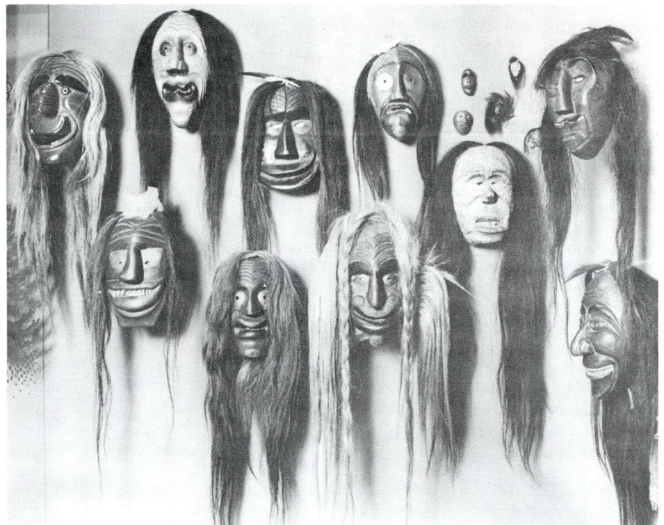
Faces of the Forest: false-face masks in "People of the Longhouse" Hall