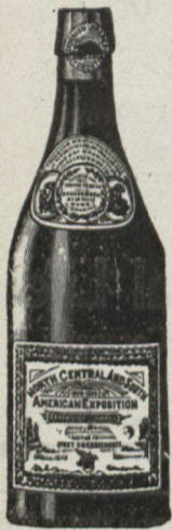
FAC-SIMILE OF WHITE LABEL ALE