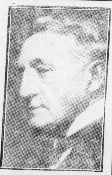
THE LATE SIR ADAM BECK.