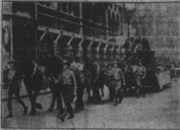
CANADA IN THE LORD MAYOR'S SHOW

It is an easy matter to criticise. Any fool can find objections. Any idiot can strike a match, light a fire, which will consume a mansion. Many people were born in the objective case. They never escape their cradle. They spend their days kicking, objecting and complaining. They are just common offensive, ever-present, irradiated nuisances. They are constantly talking about the church, what she is doing, what she ought to do, what she is not doing. They work incessantly at the business of trying to detract from the church influence and power. FIRST.—They say the church is declining. But they do not tell you that they are looking at a few fallen trees only and not at the whole forest. Of course there are dwarf-growths in the great garden of vegetation. They ought to be there. That is the place for them. There are objectionable or bad people in the church who by their lives are misrepresenting the church and reflecting upon their own membership. But they are not the whole ship. They are a very insignificant part of the church. There are hypocrites in the church. There are hypocrites in every department of life. But there are fewer hypocrites in the church than in any other department of life. The word hypocrite means, playing a part. There are very few actors in the church. There are heretics in the church who have followed the rationalistic of demon-directed Ger-