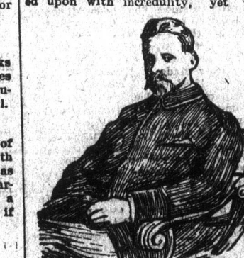
SIR WILLIAM RAMSAY.

"The announcement from London that Sir William Ramsay has discovered that the emanations from radium, when kept in a sealed condition, were converted into helium, has created considerable comment, and has caused many men of science to admit that it looks very much like transmutation—the long sought goal of alchemists for ages. The public may recall that some months ago my announcement that I was daily transforming one metal into another—namely, silver into gold—was looked upon with incredulity, yet we