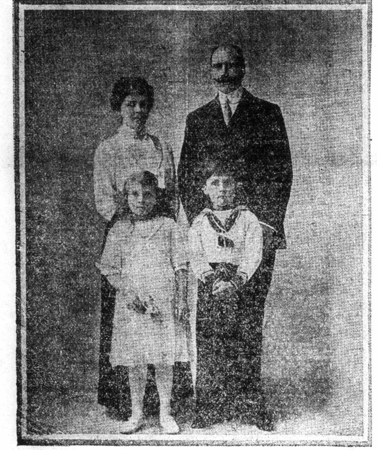
The interesting announcement that Prince Alexander of Teck was to become Governor General of Canada in succession to the Duke of Connaught was made a few weeks ago. He is here shown with the Princess and his two children, Princess May and Prince Rupert.