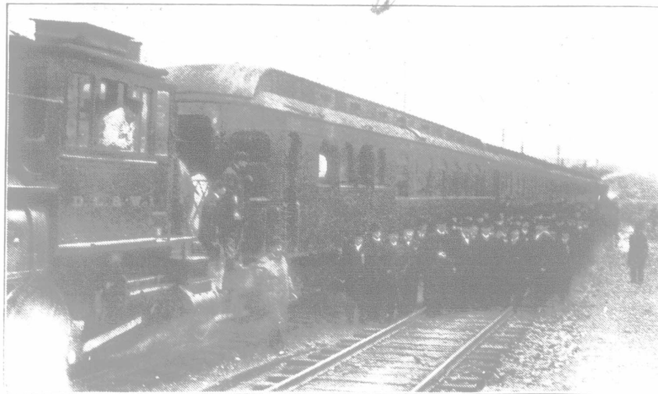
The Empire Cream Separator Co.'s Special Train.